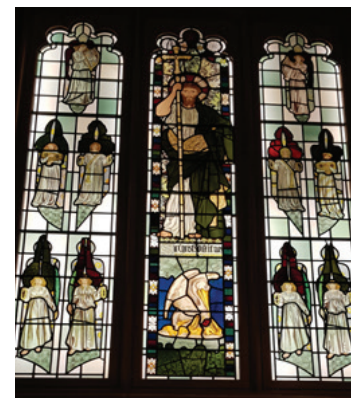
William Morris & Co