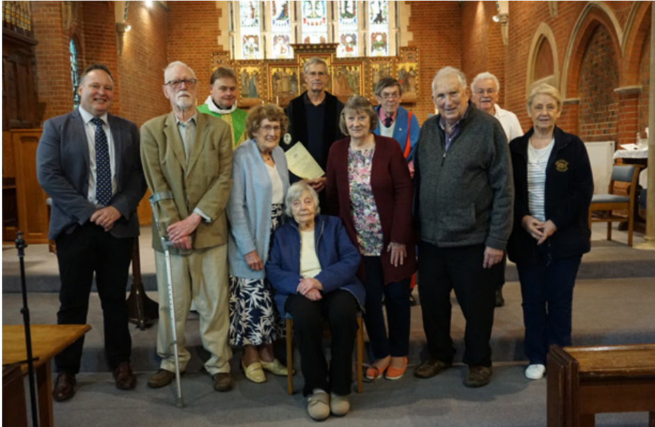
Visit to Mortimer, Tuesday, 18th June 2024

On Tuesday, 18th June, nine members of the Oxford Branch of the Guild of Vergers joined in a visit to Mortimer,