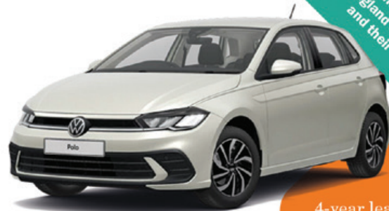
VW Polo Life 1.0 80ps 5dr (2024) in Ascot Grey